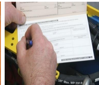
Section 3 – Routine maintenance